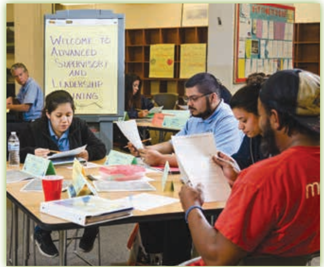
Training records on each staff member are maintained for all training specified within this program.

Technical training is required for employees responsible for the safe and effective operation of mechanical systems (e.g., boiler operations, air conditioning, and plant equipment operations).