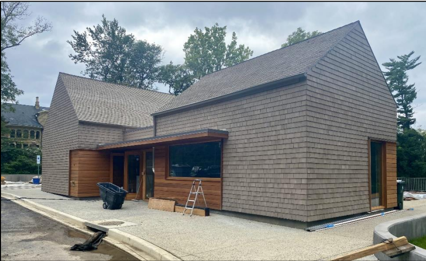
The Josiah Henson Park Visitor Center/Museum nears completion.

Montgomery Parks Foundation reports that construction of the Museum building and rehabilitation of the plantation owner's house is almost finished. Thank you for your financial support. Your contributions to the Henson Project are matched by MCPSRA.