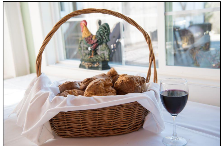
Normandie Farm Restaurant has More than Popovers

Business meeting/luncheons are held four times a year at the delightful Normandie Farm Restaurant, 10710 Falls Road, Potomac, MD 20854. Three dates remain: