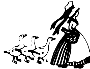
Normandie Farm Restaurant