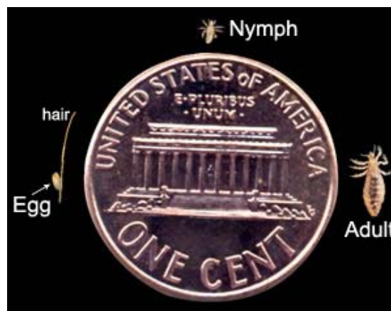
Actual size of the three lice forms compared to a penny.

There are three forms of lice: the egg (also called a nit), the nymph, and the adult.