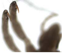
Adult louse claw