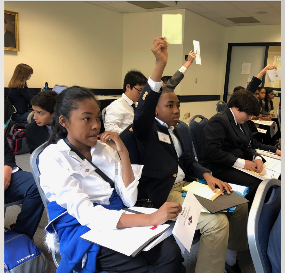
Resolutions were voted on and some were passed.