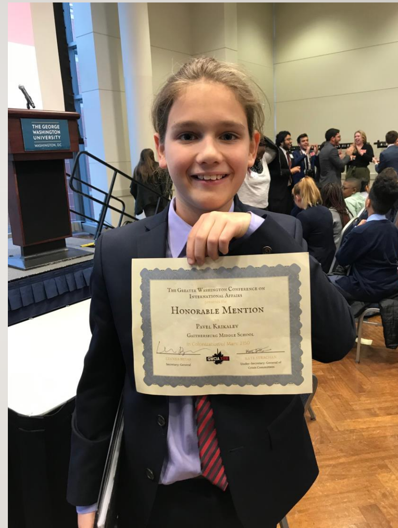
Some of our delegates were recognized for their good work.