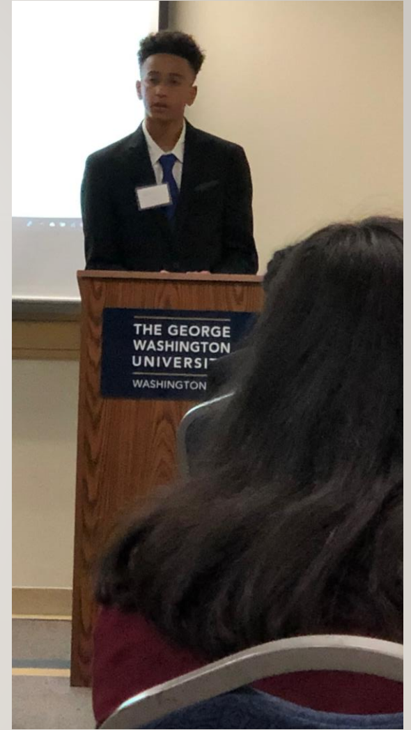
Our delegates gave speeches to solve world problems.