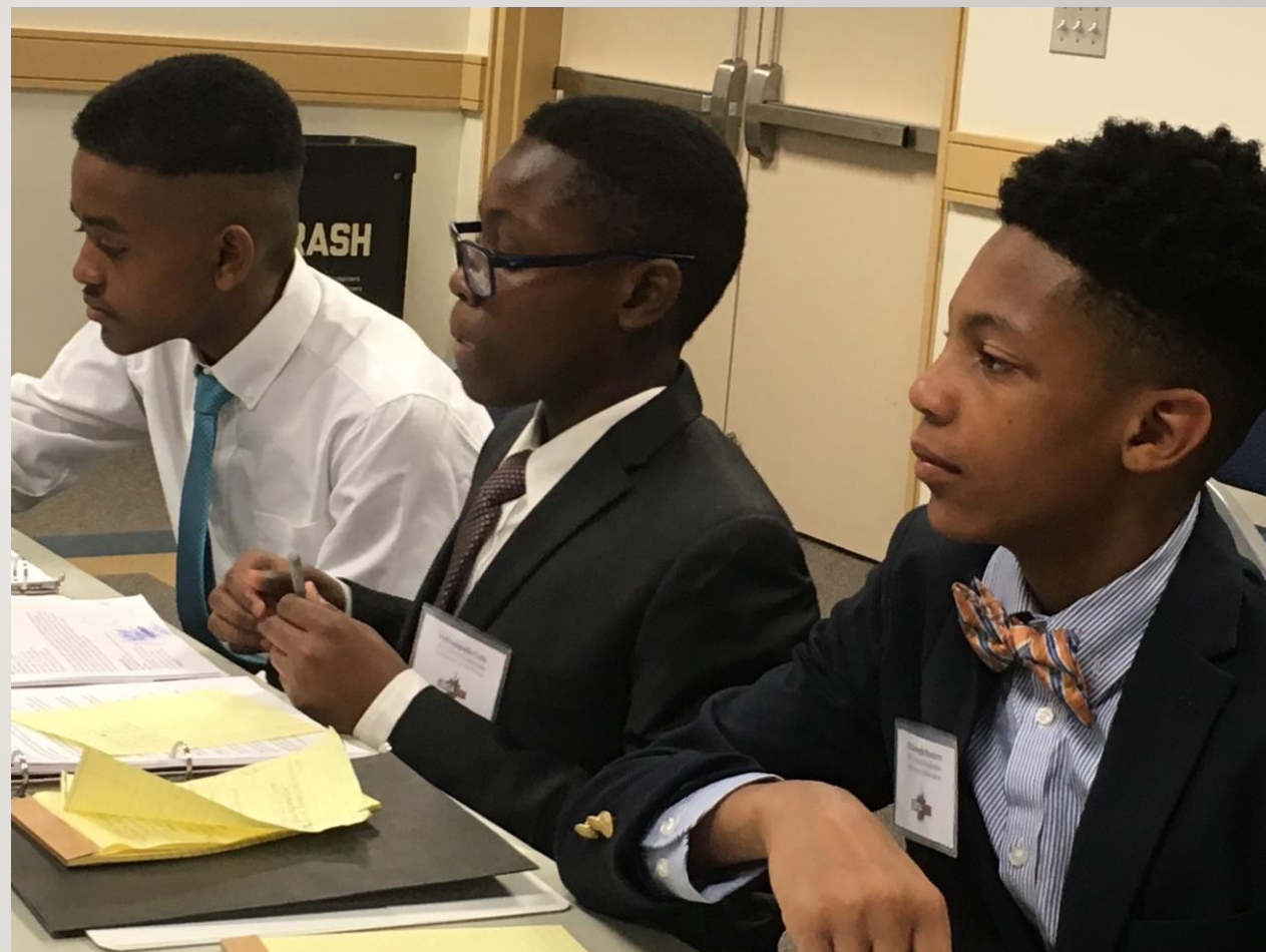
Finally the delegates wrote resolutions to solve problems.