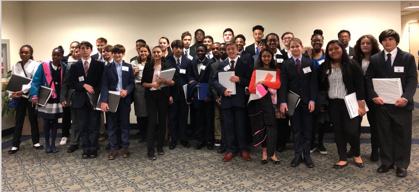
On Saturday, November 17, 2018, 33 Gaithersburg Middle School delegates competed in the Greater Washington Conference on International Affairs Model UN in Washington, D.C.