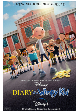
Diary of a Wimpy Kid (New Animated 2021 version)

Encanto is a Hispanic Disney film about a magical family. The main character, Mirabel was the only person in her family without magical powers. No one knows how or why. Her uncle Bruno also vanished mysteriously and is a disgrace to the family. I feel like this movie is very overrated. I do enjoy some of the songs like Dos Oruguitas and We don't talk about Bruno. In my eyes, this is just another normal Disney movie. Somehow, the popularity has grown by a million and even won an oscar award. I am definitely shocked by this and don't think Encanto lived up to its hype.