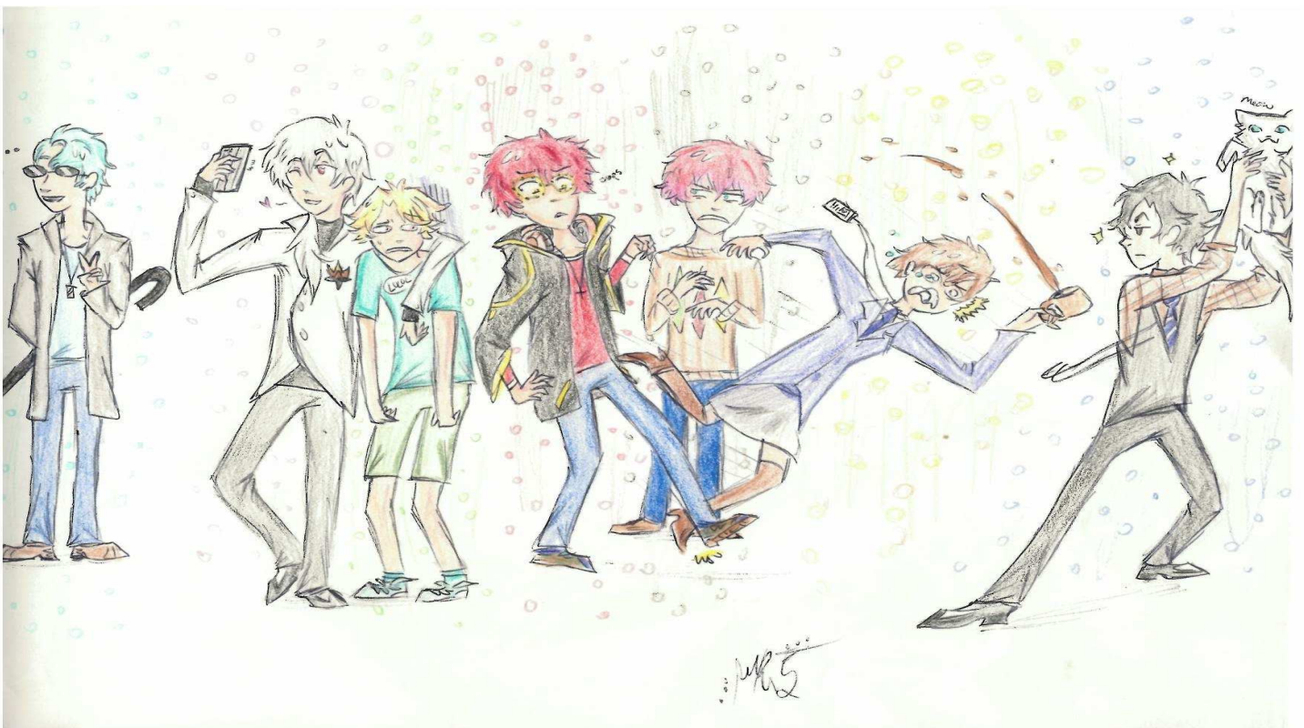
Artwork by: Rosita Sueydie

All in all, "The 5th Wave" movie was a mixed bag, in comparison to the book. The movie has some plot holes that the book accounts for, but overall, the minor changes in the movie didn't necessarily mess up the in general feel of the book itself.